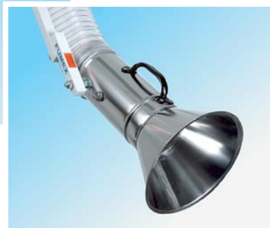
Stainless steel suction nozzle

R 1500, 2000, 3000, 4000 with gas spring